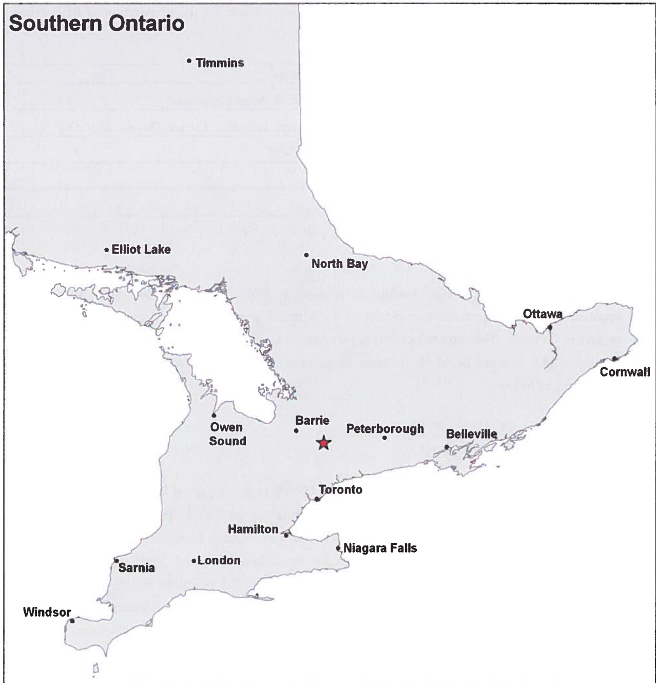
Figure 1: General Location of EarthLight in Ontario