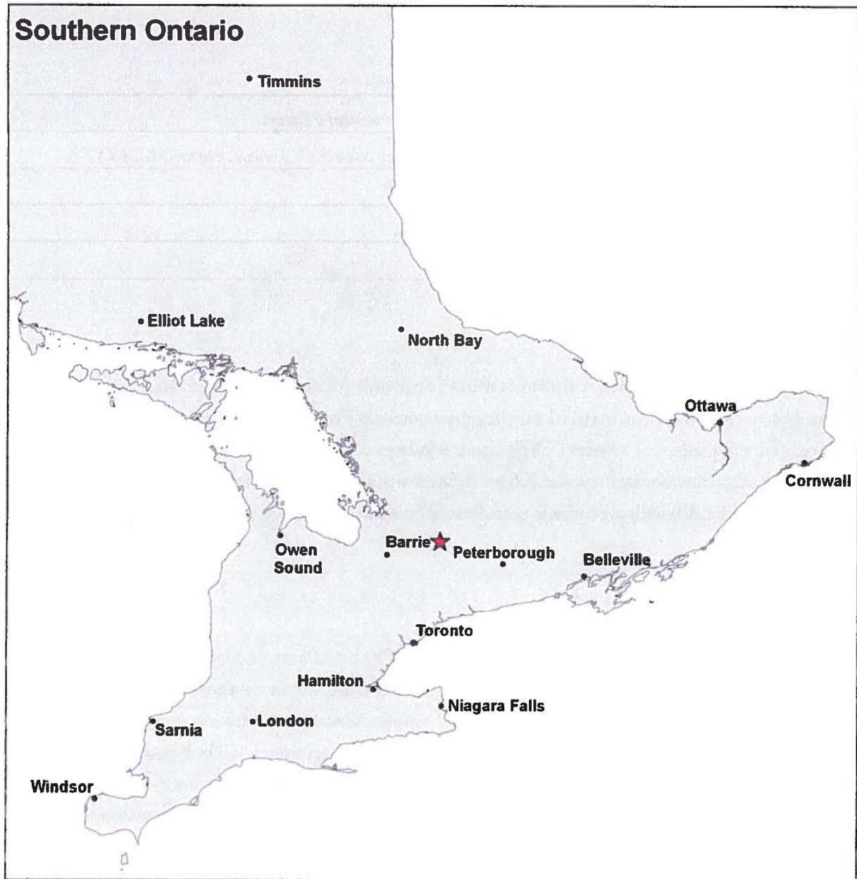
Figure 1: General Location of GoodLight in Ontario