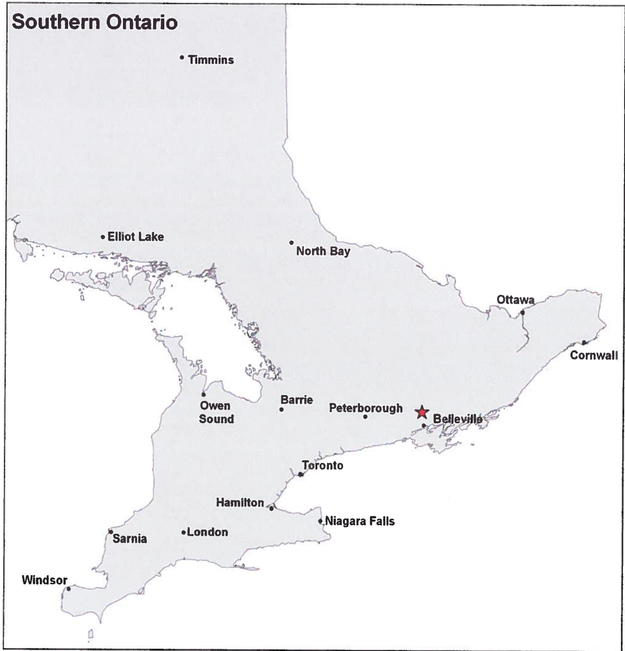
Figure 1: General Location of LunarLight in Ontario