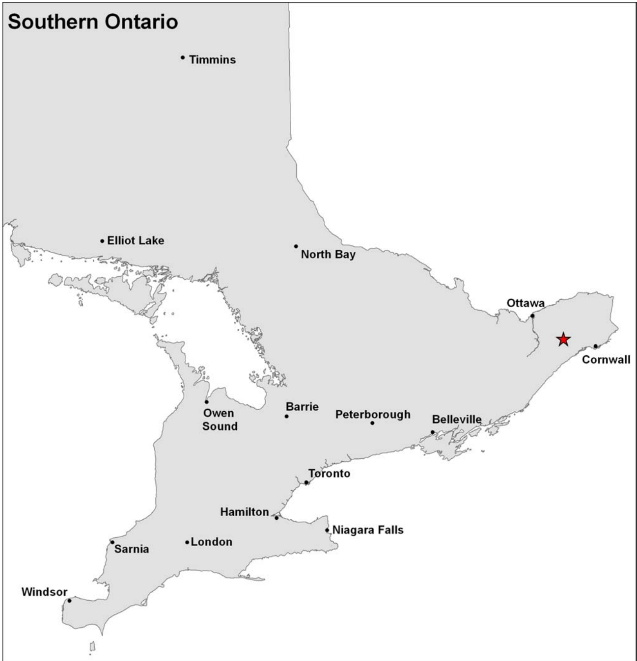
Figure 1: General Location of MightySolar in Ontario