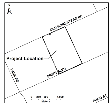
Project Name: EarthLight Project Location: The proposed site for the project is located on Old Homestead Road in the Town of Georgina.

130 Adelaide Street West, Suite 30 Toronto, ON M5H 3P5 Office: 416-979-4625 Fax: 416-981-8686 info@skypower.com